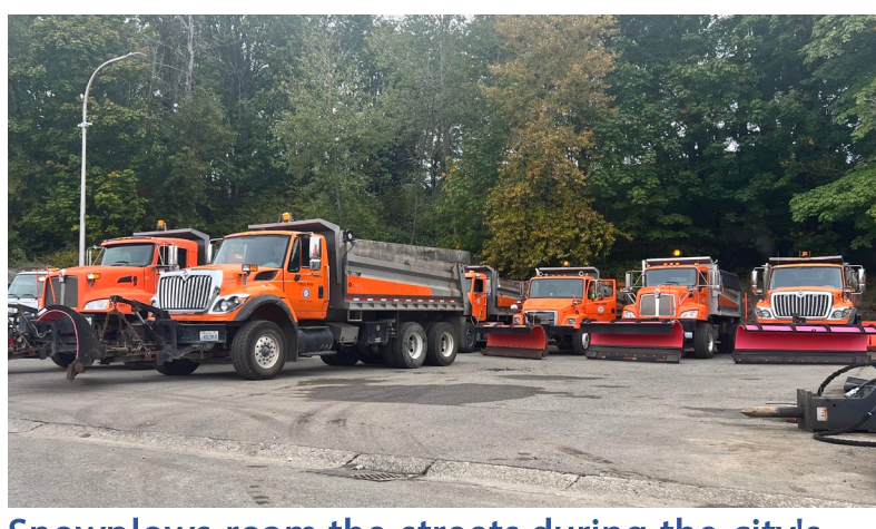
Snowplows roam the streets during the city's annual winter prep

For more information, visit <u>Renton's domestic violence</u> <u>resource page.</u>